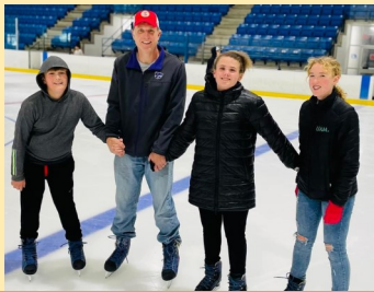
The Carothers Family enjoyed ice skating during Spring Break