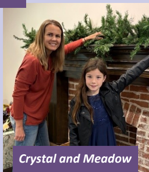
Crystal and Meadow