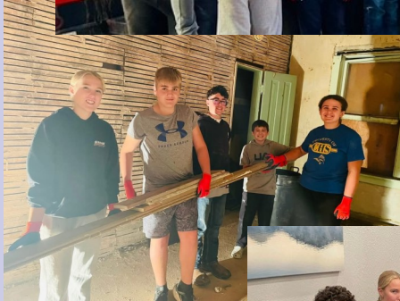
The Youth Group met to help with a clean up project at the Chandler home.