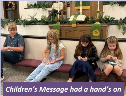
Children's Message had a hand's on activity!