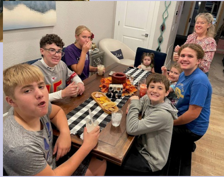
Of course the Chandlers thanked them with lots of yummy treats!