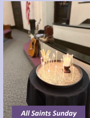
All Saints Sunday