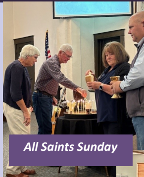
All Saints Sunday