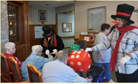
SNOW MUCH FUN Event at Country Living Jan. 18