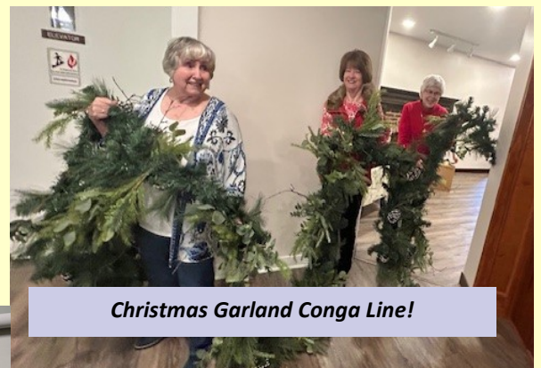
Christmas Garland Conga Line!

THANK YOU to everyone who stayed after church and took down and stored all the Christmas decorations Jan. 4!